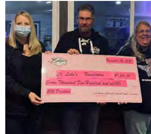
On Saturday, September 11th, Northland Bikers for Breast Cancer Awareness held their 14th Annual Bike Run in South Range, Wisconsin. Their Board of Directors and volunteers celebrated a record breaking event and presented St. Luke's Foundation with a check for $7,500. Their gift supports the Cancer Care Fund with provides wigs, scarves, hats, gas cards, grocery cards, chemo care bags, support groups and classes for no cost to cancer patients. Thank you, Northland Bikers for Breast Cancer Awareness!