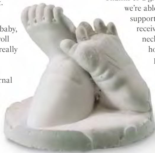
A keepsake mold of a lost baby's feet.