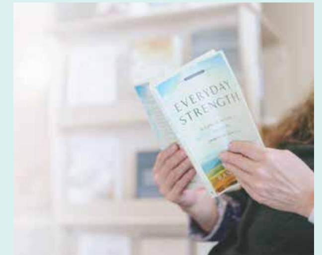
A patient reads a book from the Cancer Center Resource Cart.